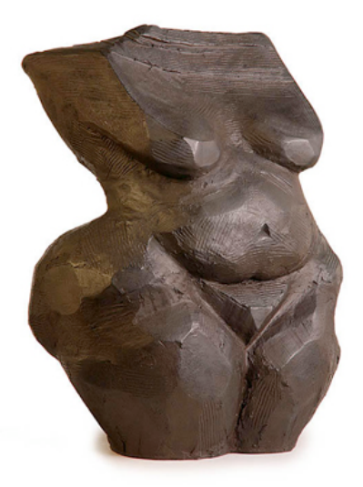
Leslie Begert Big Pomona Cold Cast Nickel Graphite 21x15x15 in.