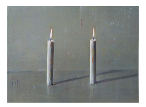
Valentin Popov Two Candles Oil on Canvas