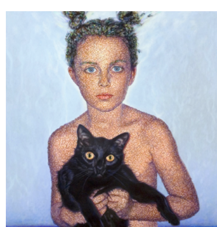
Margaret Munz-Losch Black Cat Acrylic and Colored Pencil on Wood Panel 30x30 in.