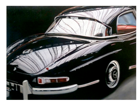
Cheryl Kelley 300SL Oil on Wood Panel 18x24 in.